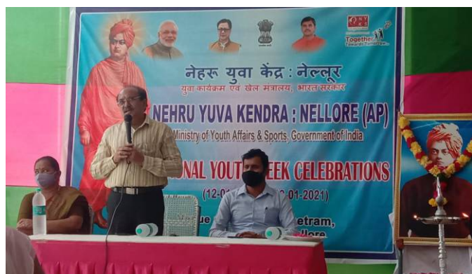
Principal of D.K.W College Addressing the Gathering